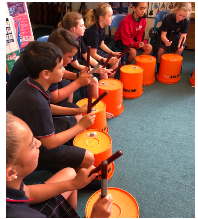
Year 7 students from Room 13 enjoying their drumming sequences in Music.